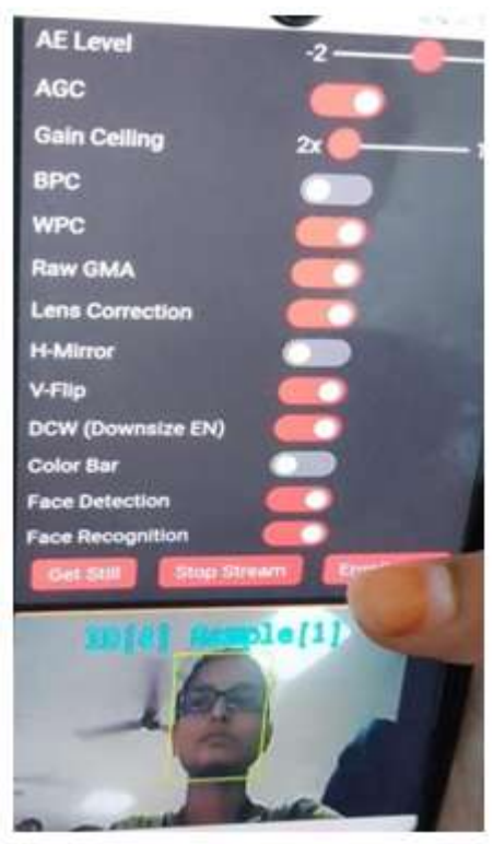
Fig.4. Person-2 Sample Collection