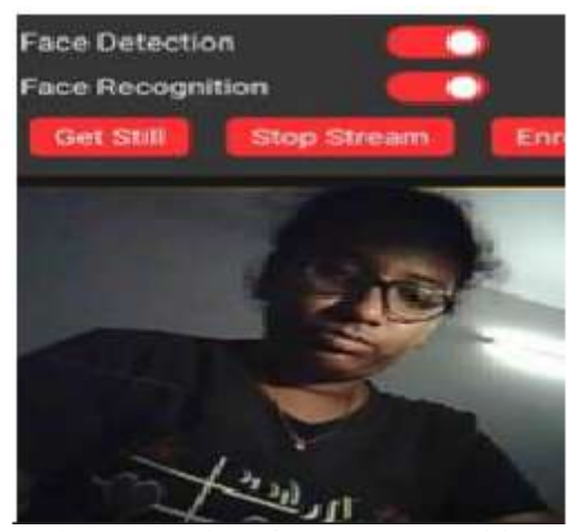
Fig. 2. 3 Options for Face Recognition

When the system is powered on, after browsing the resulted link we get a streaming window opened where we can see the option as illustrated in the below fig: 2where we need to switch on the face detection and face recognition button and then click on enroll face. After clicking that camera starts taking samples as shown below in fig: 3,4 after completion of taking samples, the data is stored.